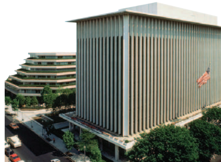
Renovated its headquarters complex to become a LEED-EB Silver facility, 2003.