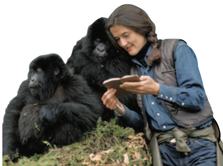
Made an intensive study of mountain gorillas, 1967–1983.