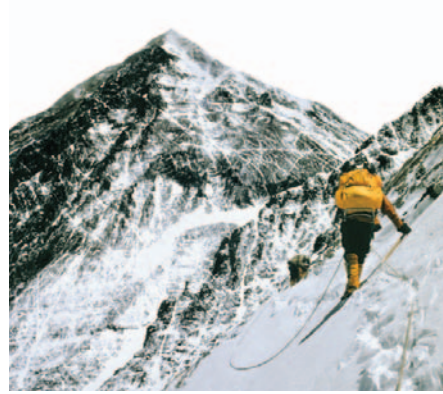
Reached the summit of Mt. Everest, 1963.