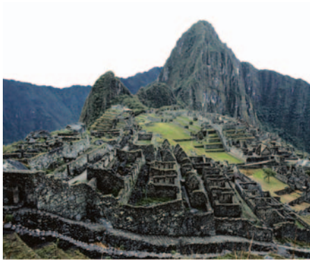
Excavated the ancient city of Machu Picchu, 1911.