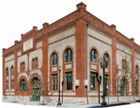
Patagonia's new Portland store, leased in the Ecotrust Building, a LEED-NC facility.