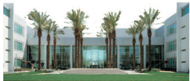
Toyota's new California headquarters, a LEED® Gold facility.