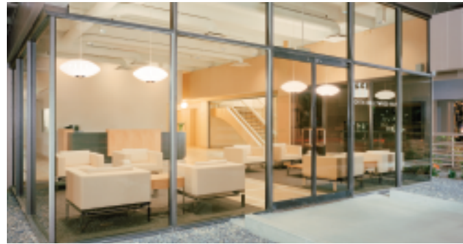
Warner Bros. Studios' International Television Distribution Building, a LEED-CI pilot project.