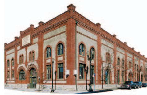
Patagonia's new Portland store, leased in the Ecotrust Building, a LEED-NC facility.

WHERE PATAGONIA EMPLOYEES GO TO GET FRESH AIR AND DAYLIGHT.